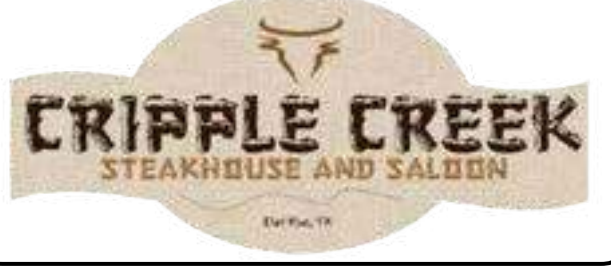
PAID ADVERTISEMENT. NO FEDERAL ENDORSEMENT INTENDED